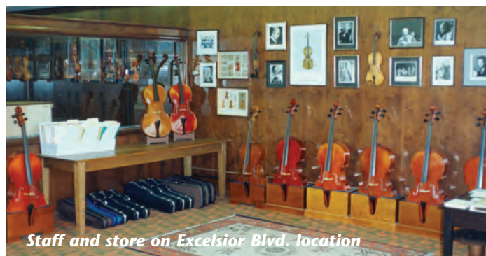
Staff and store on Excelsior Blvd. location

trusty Sears Workmate repair bench after folding a dirty army blanket on it. Who knew what Yo -Yo thought of this operation.